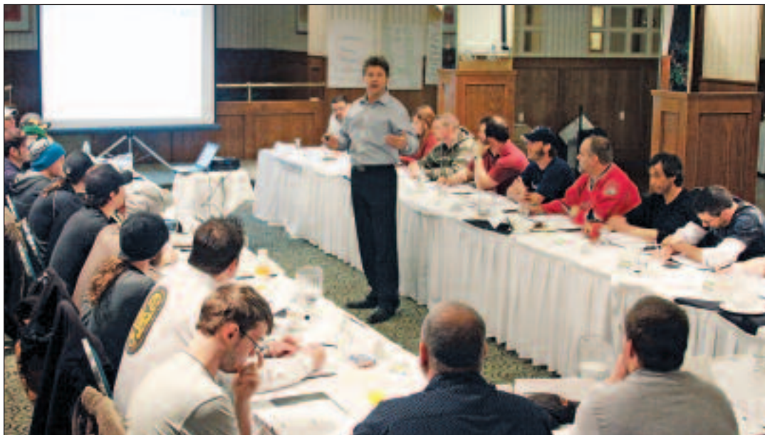
The LMCI Supervisor Training Program, such as this recent one in Vancouver, British Columbia, for IUPAT District Council 38, is designed to strengthen the abilities of project supervisors at all levels.

The LMCI Project Management Program provides some of the tools that an effective project manager needs, such as how to plan, lead,