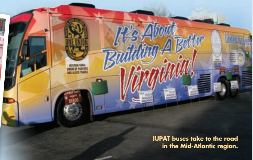
IUPAT buses take to the road in the Mid-Atlantic region.